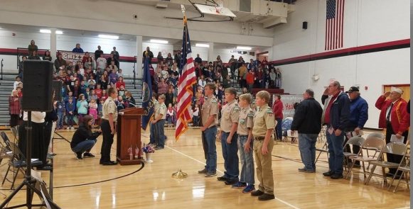
Veterans Day Program

Members are getting ready for a busy December with several community service projects and for the District IV competition to be held on January 13, 2020, at our school.