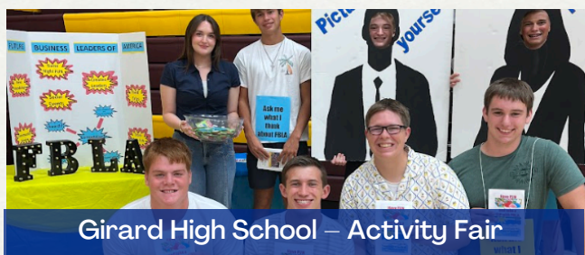
Girard High School – Activity Fair

Washington County High School is kicking off the new year with a jam-packed schedule full of fun, teamwork, and new faces. So far, they have hosted an Officer Retreat with goal-setting and teambuilding activities, and they held a Recruitment Party to encourage new membership. They are also looking forward to organizing an Ice Cream Social to celebrate paid members. Washington County has had an amazing start to the year, and they are excited to have new and returning members as part of their journey.