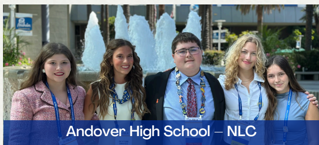
Andover High School – NLC

The recently reactivated chapter , Topeka West High School, is making powerful strides to accomplish great things in this new membership year. After five years without members, Topeka West proudly had two student leaders step up last year as re-founding members. They are optimistic about the future of their chapter as they had 37 members sign up at their beginning-of-the-year Club Carnival , and they have hosted meetings with an average size of 12-15 members