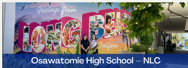
Osawatomie High School