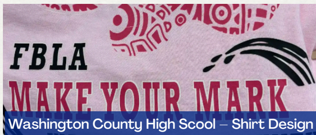
Washington County High School – Shirt Design