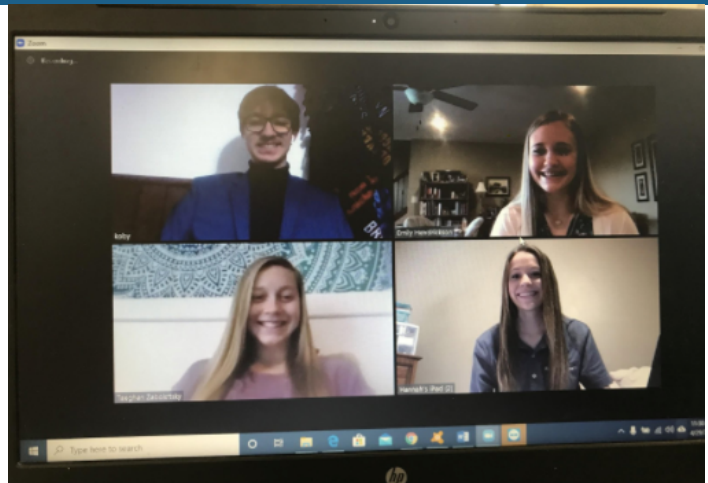
Senior FBLA Officers came together through Zoom meeting to interview officer candidates for next year.

Despite the surreal circumstances we find ourselves in today, FBLA competitions continue, though in a new and unique format. From state success to hope for Nationals, the Hanover FBLA chapter has adapted well to the new system and has had many members flourish in their respective competitive events. The FBLA State Leadership Conference was originally planned for March 31-April 1. The in-person event was cancelled, but individuals from across the state were able to virtually submit their